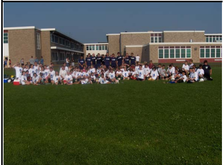
Travel Camp, August 2007